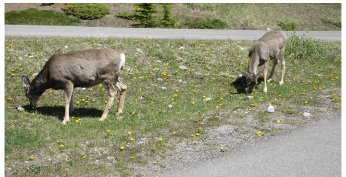
Brian soliciting possible new members from K-Country