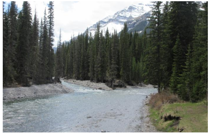
Junction Creek, late May 2021

June 7 is the first of only 13 sitting days remaining before MPs leave Ottawa for the summer adjournment. Two of those days will be supply days, devoted primarily or entirely to opposition motions. 16 government bills are still in the House of Commons or awaiting first reading there. Eleven of those bills have yet to be progressed to committee stage for in-depth scrutiny, a process that itself often takes a week or more and is followed by one or two more stages of debate and then scrutiny by the Senate. Some of those bills are little more than clutter on the legislative agenda: Media pundits currently are of the opinion that an election will be called sometime in August.