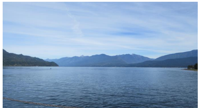
View from the bow of Osprey 2000 ferry Going to Balfour from Crawford Bay in the Kootenay region of British Columbia