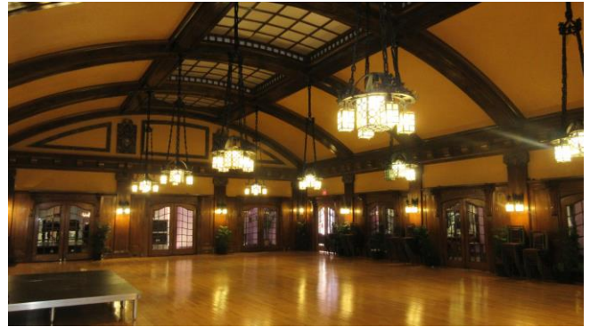
Royal Alexandra Hall, once part of the Royal Alexandra Hotel in Winnipeg, MB. Cranbrook History Centre, Cranbrook

A quote from Arnold Swartzanegger Aug 12/21; "I think people should know there is a virus here, it kills people, and the only way we can prevent it is to get vaccinated, to wear a mask, social distancing, washing your hands all the time, and not just to think about my freedom is being disturbed here. No, screw your freedom, because your freedom comes with obligations and responsibilities. Yes you have the freedom to not wear a mask, but you're a schmuck for not wearing a mask" ouch!