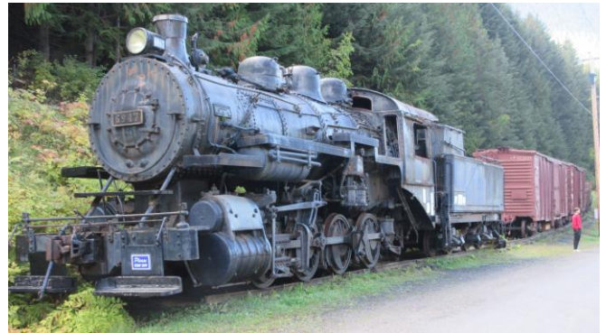
Display at Sandon, BC. Former wild silver mining town now part of the Valley of the Ghosts.