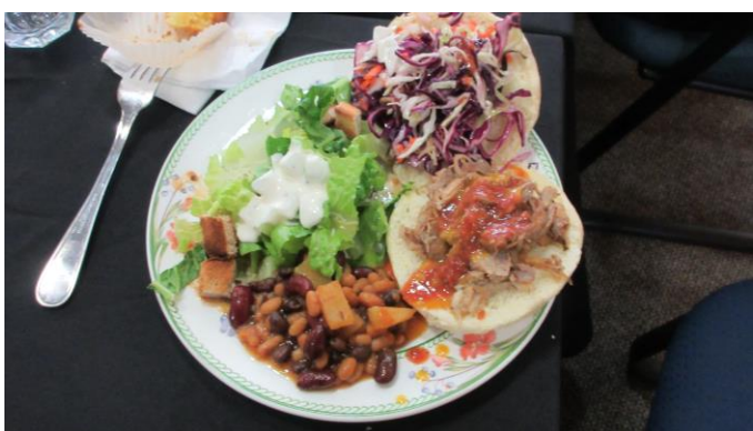
Wasn't that Picnic IN the Kerby luncheon of pulled pork, coleslaw, baked beans, Caesar salad and combread muffins delicious?!