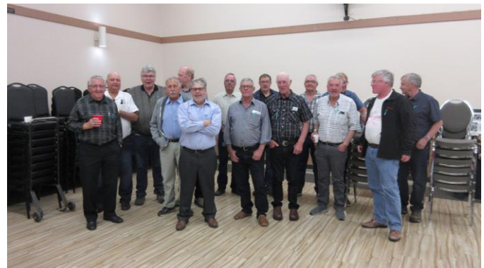
Better, but still don't have everyone's attention and where is that guy in the red shirt...