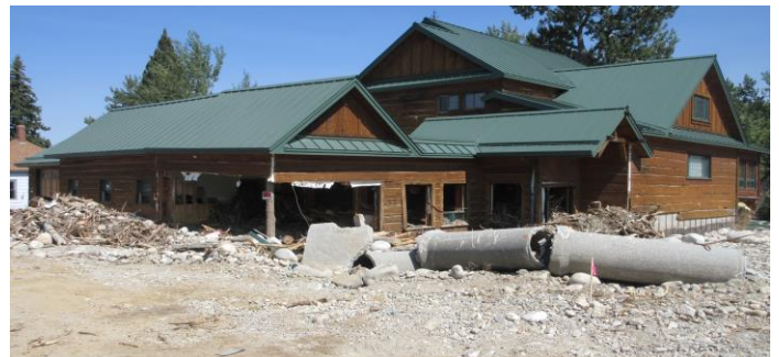
Devastation from spring 2022 floods, Red Lodge MT