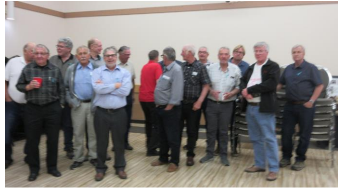
The motley crew – notice how they don't know how to actually be in a photo?