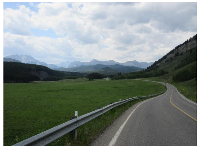
The long and winding road that, like us, goes ever on...