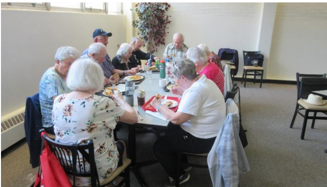
A great time was had by all!