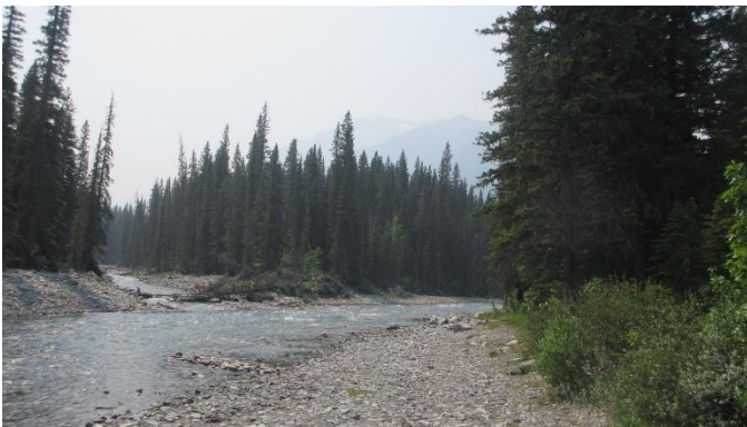
Junction Creek, K-Country June 2025. Note the extremely low water levels. And no snow left to melt (below).