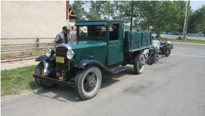
Nice truck! Turner Valley 2025

Normal hours of operation will resume on July 2, 2025.