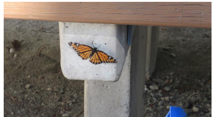
Monarch butterfly on camping table, Beartooth Pass, Montana

We are looking for 1 or 2 additional evaluators for the 2024 Scholarship Program. Please contact me if you or one of your local members may be interested in helping out. (Ask Brian or Judy for the correct contact information.)