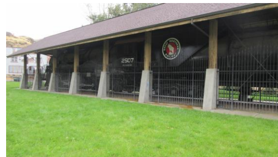
Class P-2 Engine No. 2507 built by Baldwin 1923, Great Northern Railway, retired 1955. Resides in Wishram, WA alongside the very active BNSF mainline.

*Note – the latest information from the Alberta government says both the annual flu shot and the next COVID shot will be available after Thanksgiving but you should call to book your appointments anytime. J